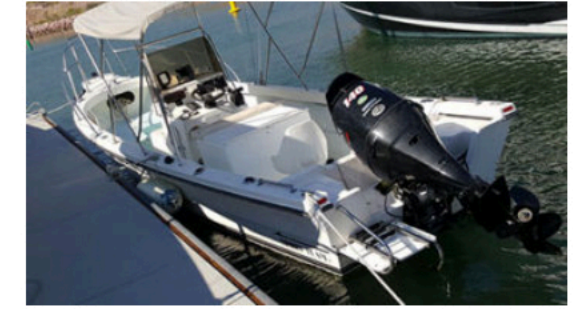
Attendant dive boat for easy access