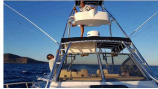
Sportfisher with Tuna Tower