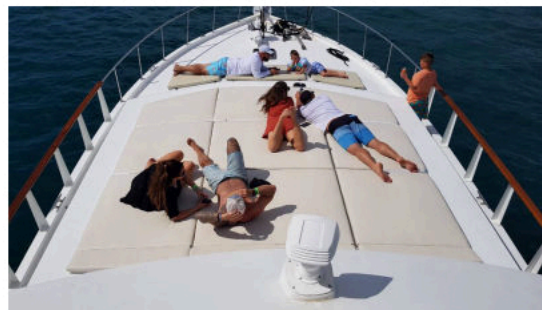
Many areas for relaxation