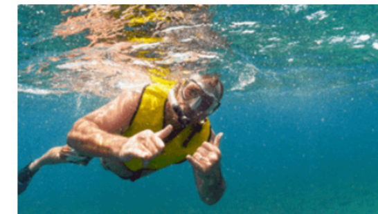
Snorkel vests (as opposed to bulky life jackets)