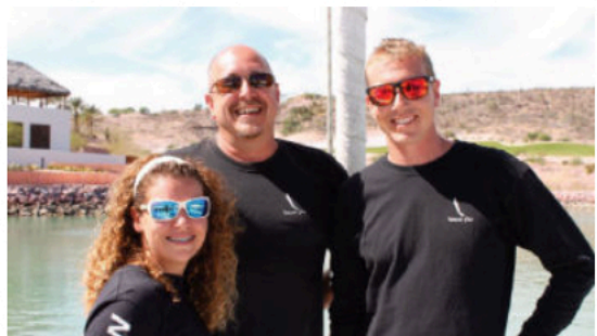
Educated, professional, english-speaking crew