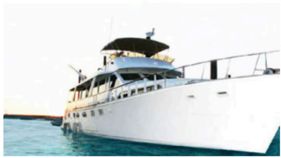
Private Liveaboard 96' Yacht