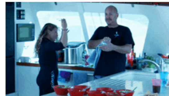
Chef on board