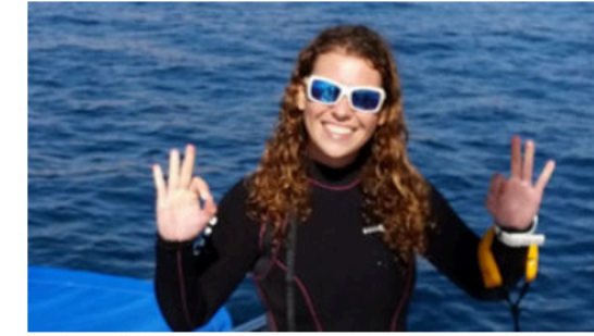
Marine Biologist as teacher, hostess and guide