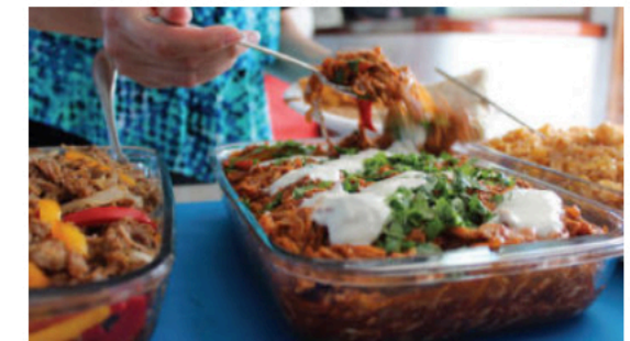
Two meals included