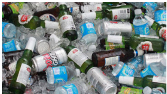
Snacks, bottled water, soft drinks and beer