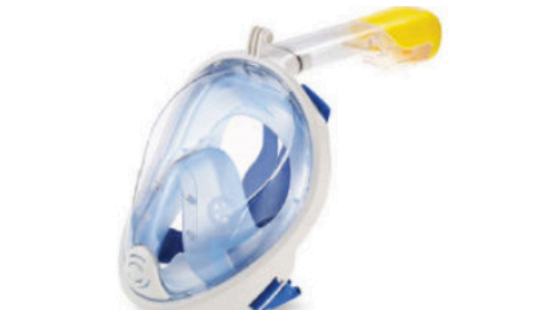
Clean, new snorkel equipment