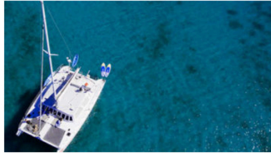
Large, spacious, sailing catamaran