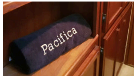
Freshly laundered towels