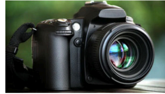
Bring your own camera!