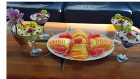
Local farm fresh vegetables and fruits brought daily